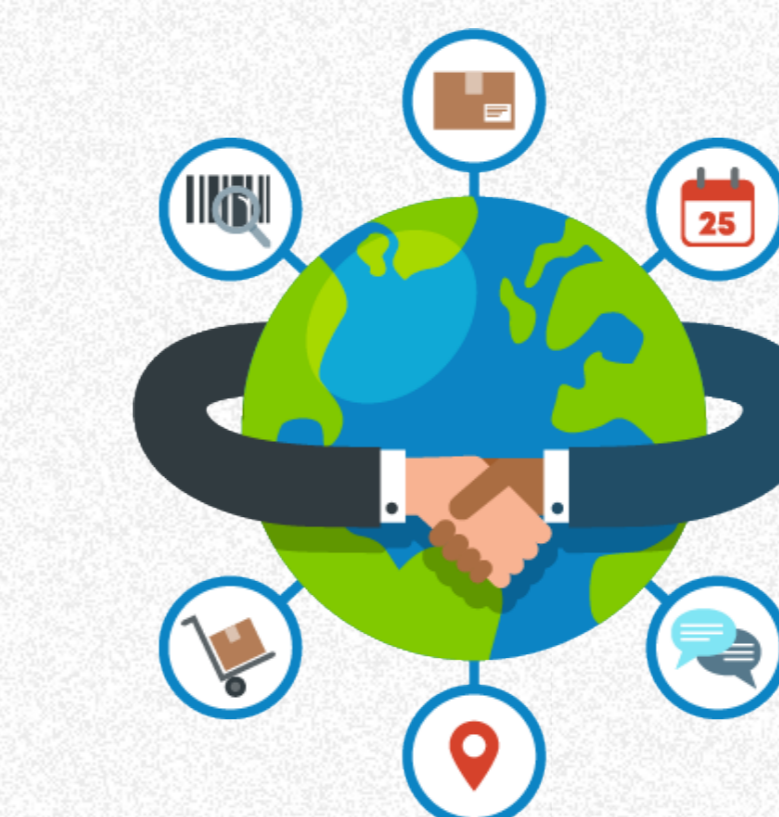
where the UK trades